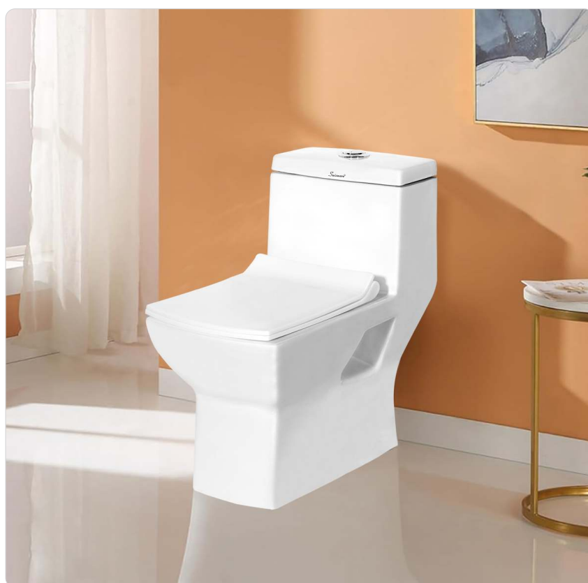
105 (9") L-26,B-14,H-27