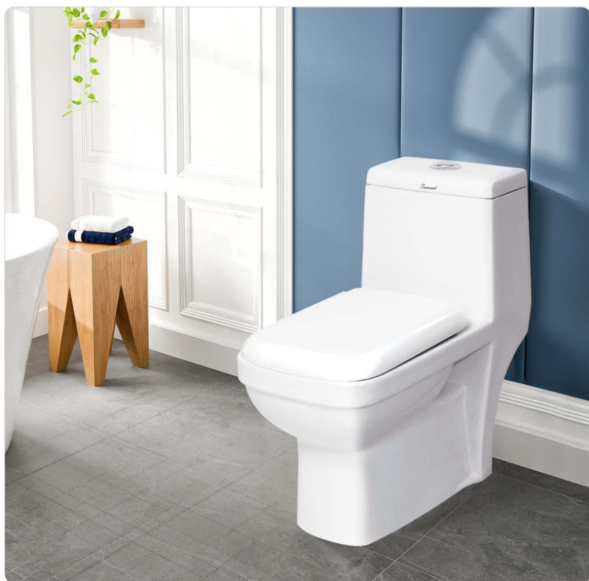
103 (9") L-27,B-14,H-27