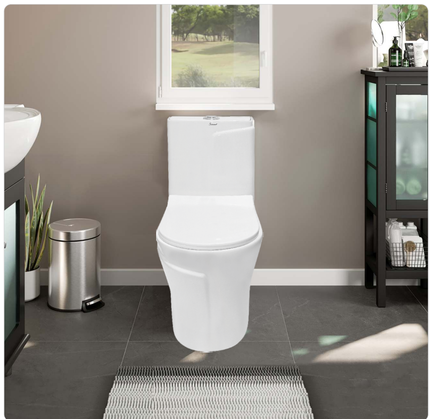
115 (9") L-26,B-14,H-29