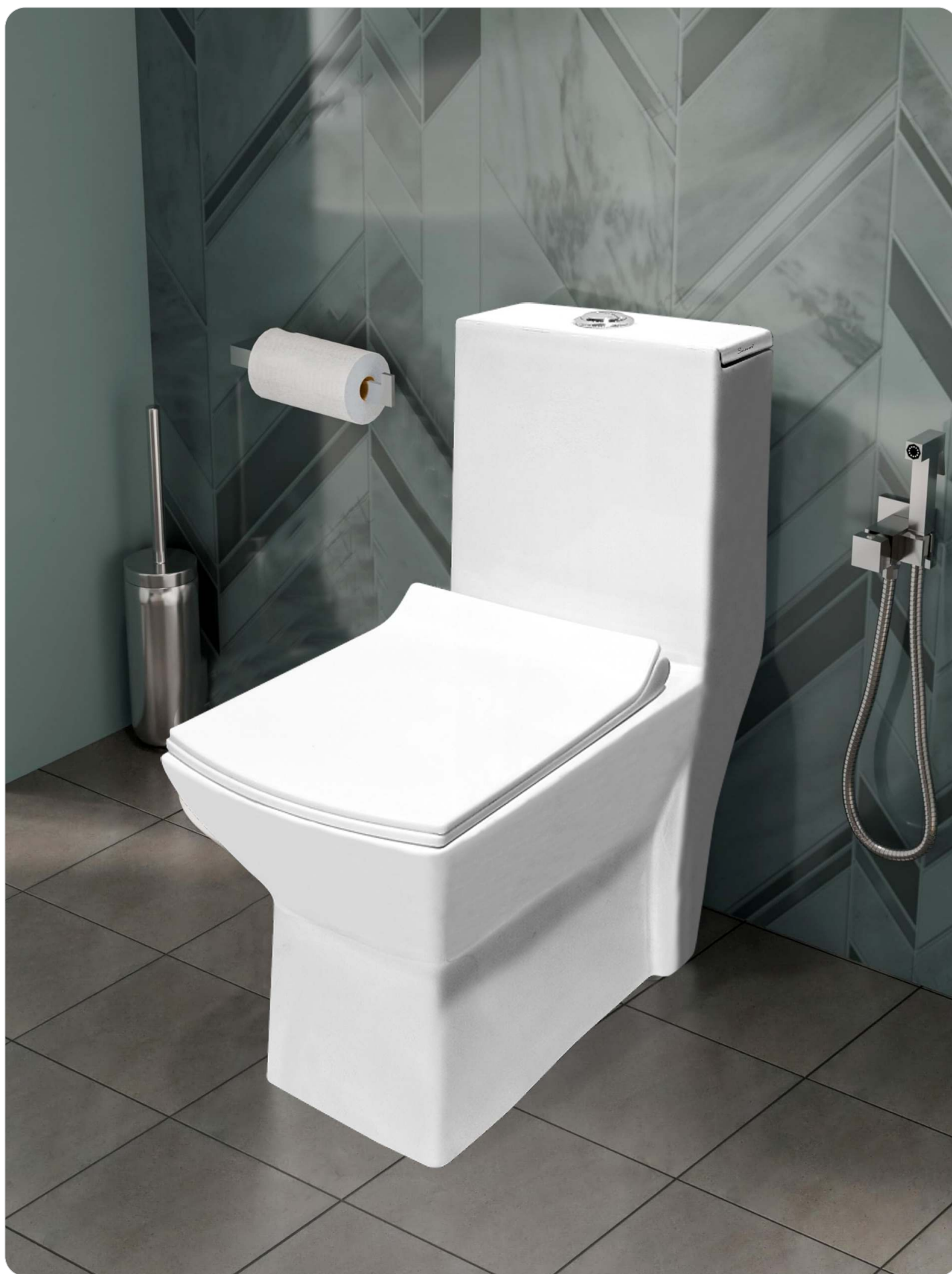
SYPHONIC (9") L-26,B-14,H-30