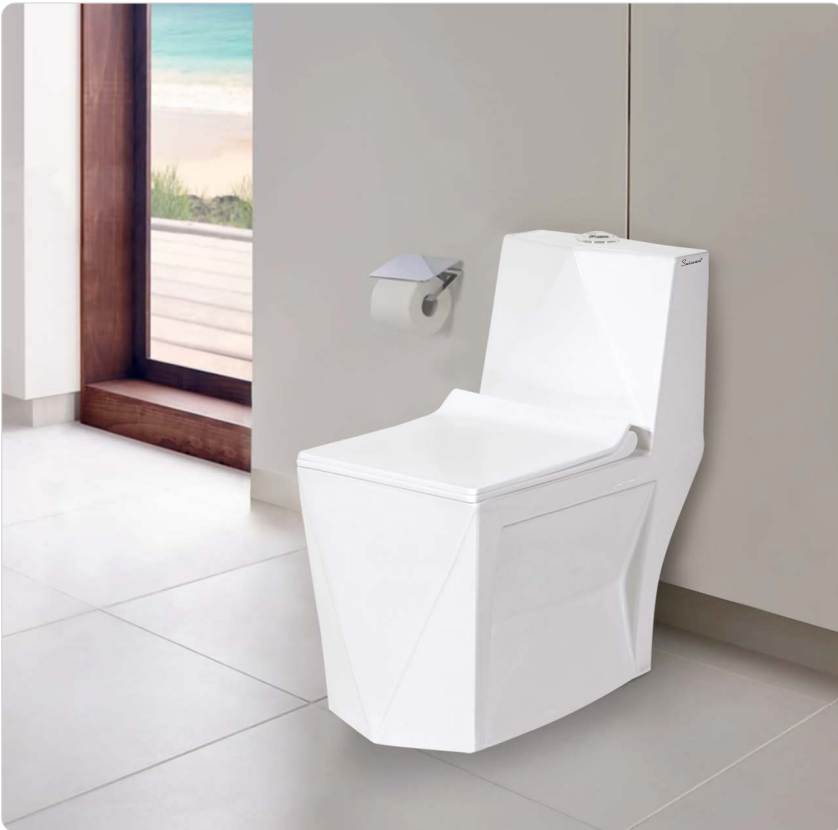
113 (9") L-25,B-14,H-28