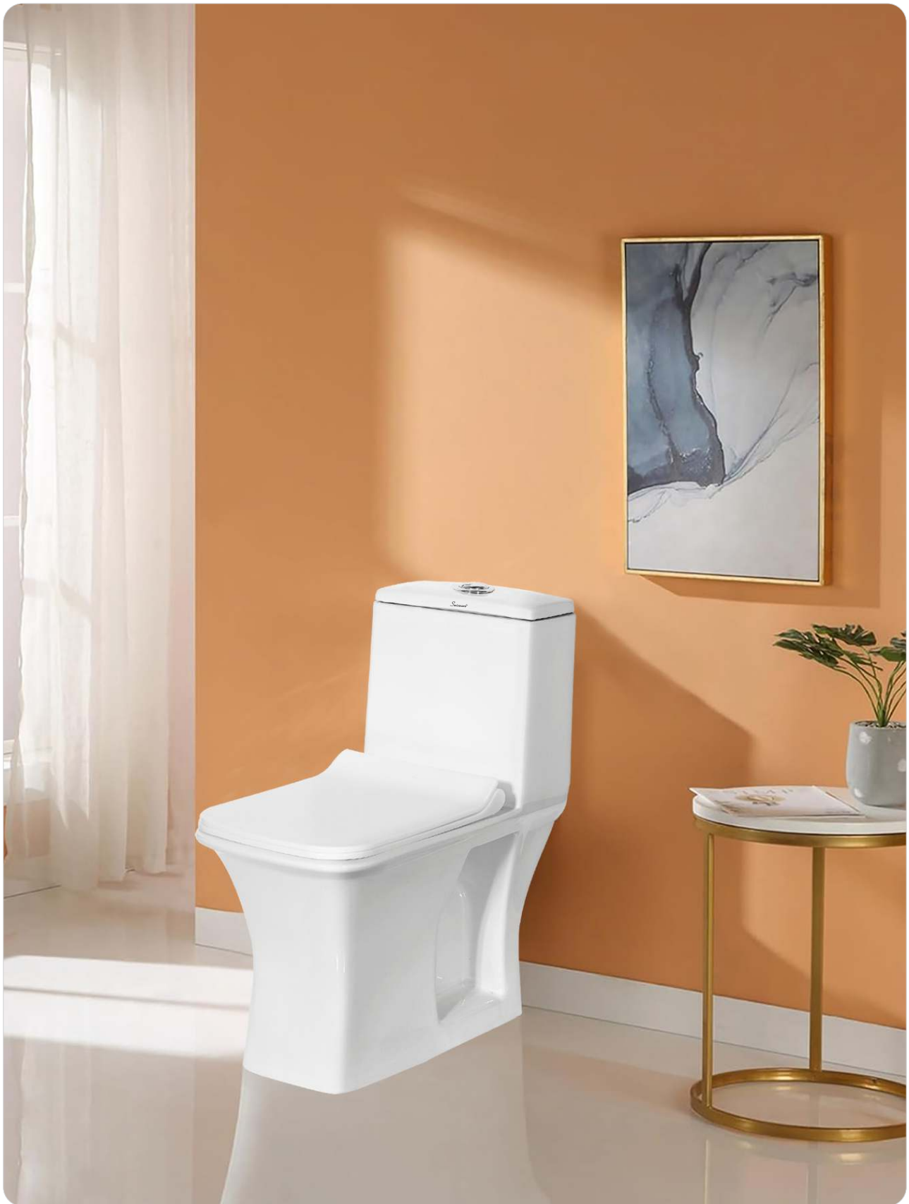
107 (9") L-26,B-17,H-30