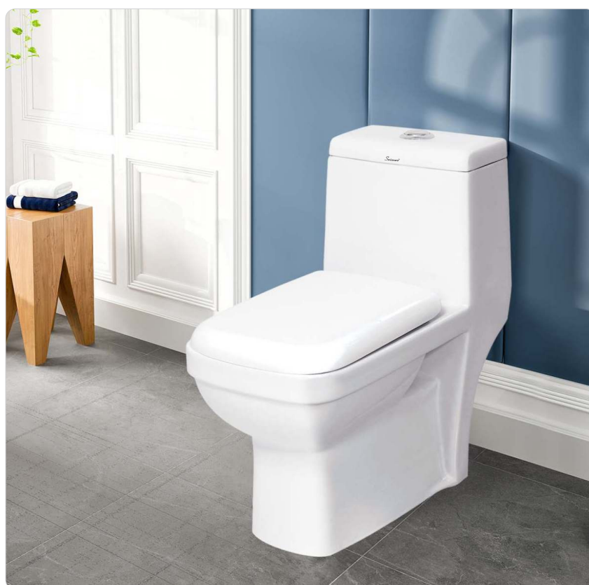
204 (4") L-27,B-14,H-27