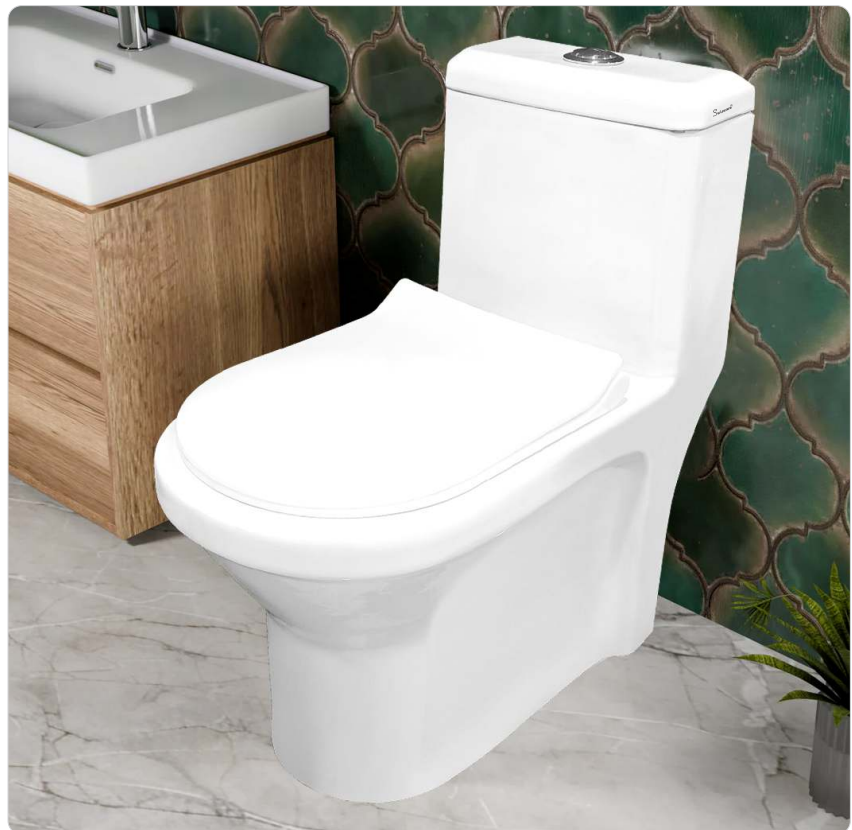
112 (9") L-26,B-14,H-28