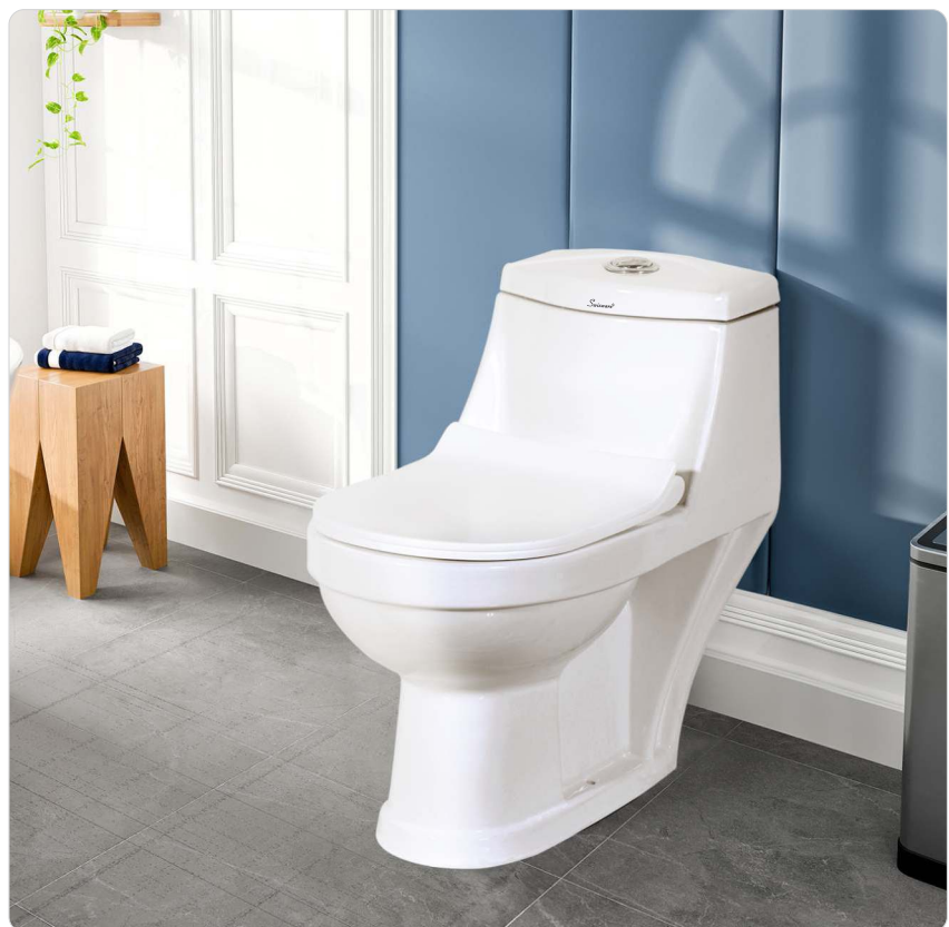
111 (9") L-27,B-14,H-25