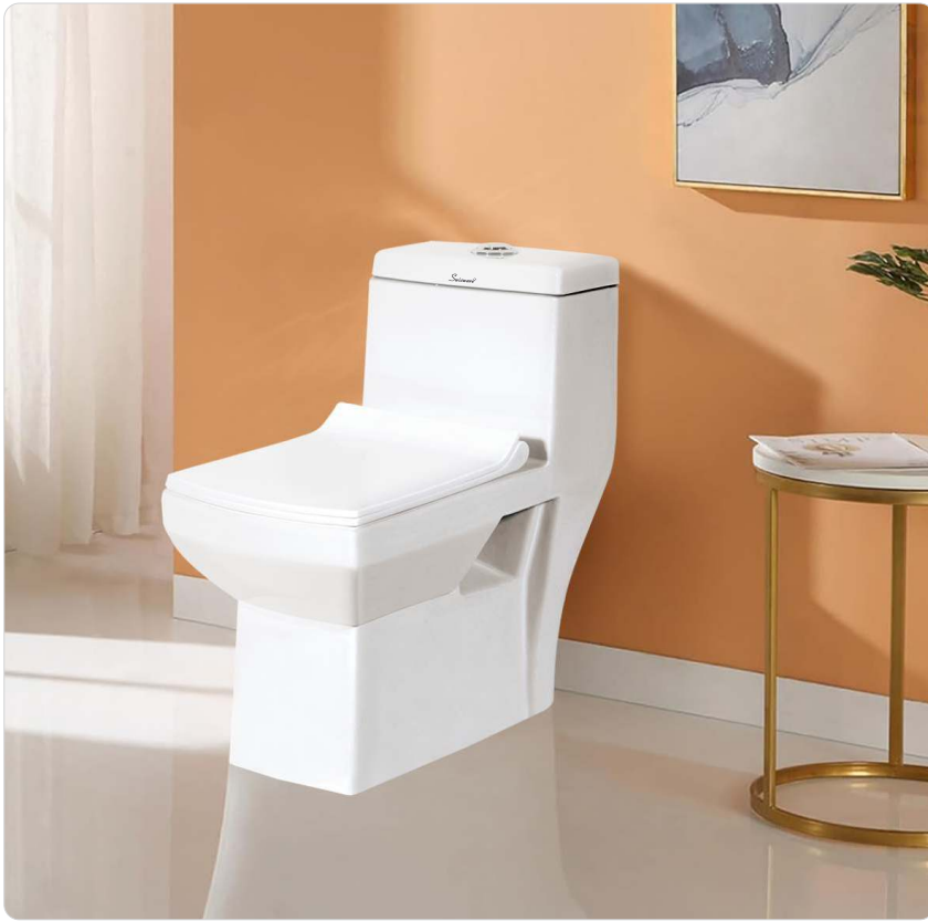
110 (9") L-25,B-14,H-27