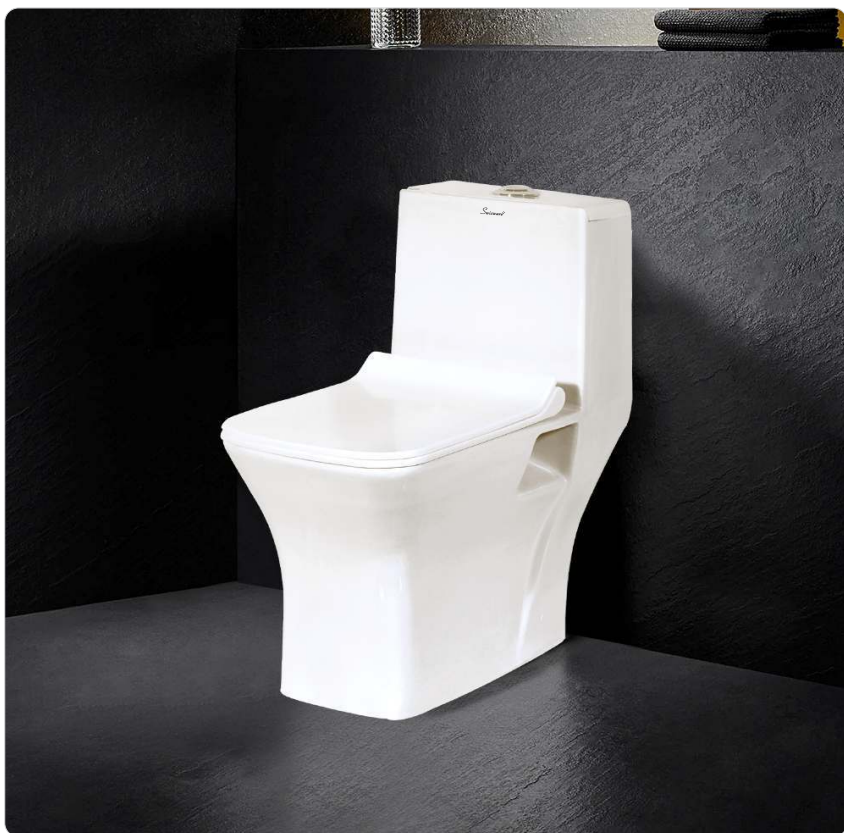
108 (9") L-25,B-14,H-27