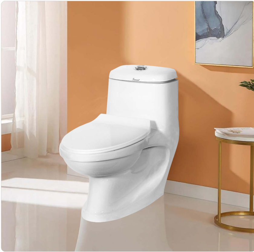
102 (9") L-27,B-15,H-26