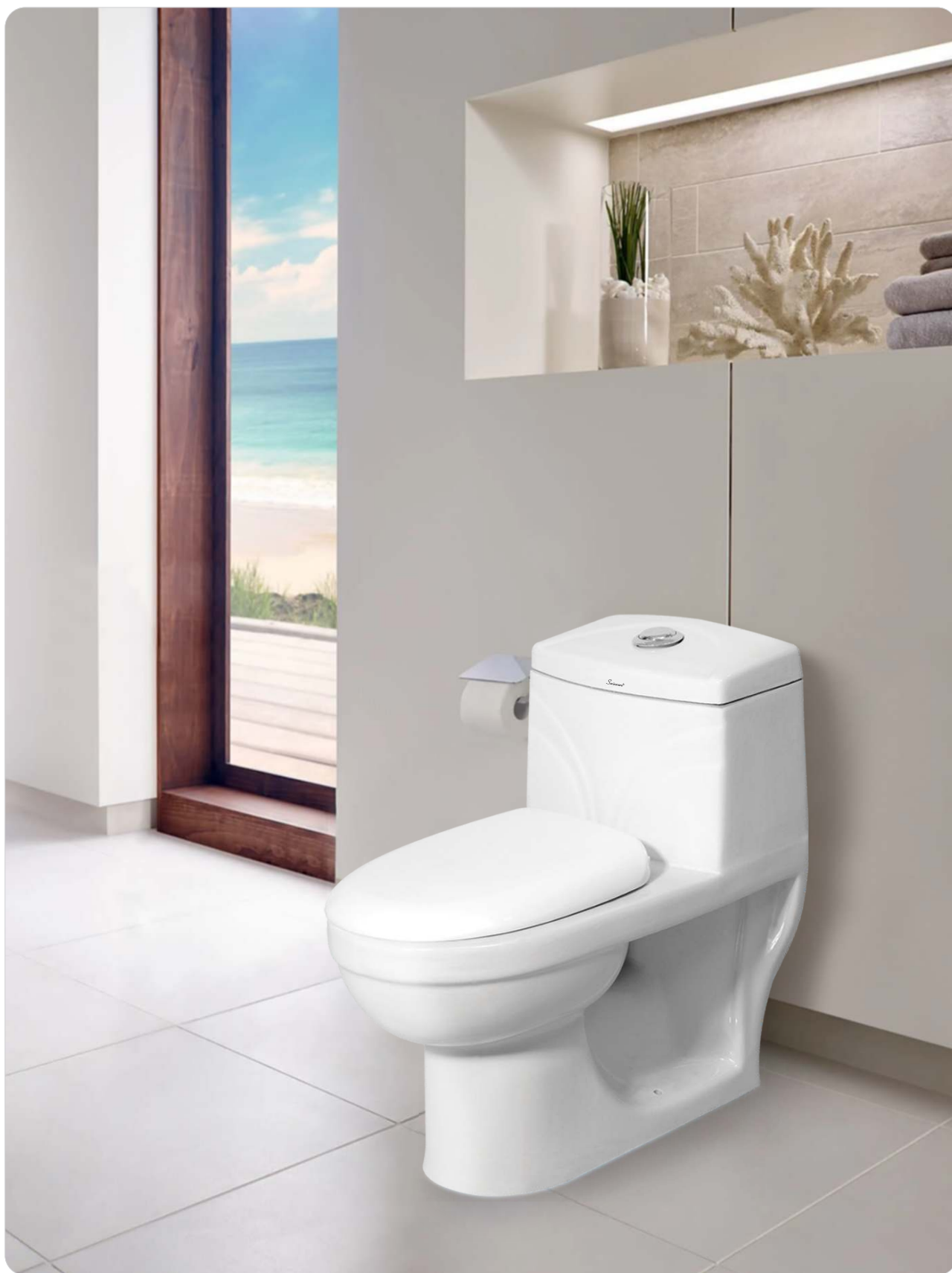
101 (9") L-26,B-15,H-26